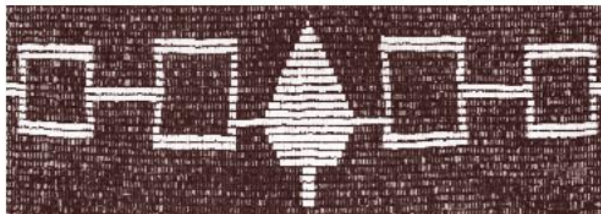
SENECA NATION Keepers of the Western Door

Without having access to writing materials, there was no way to record the Great Law. Using the wampum beads, a belt was created that shows the 5 original nations begin connected with a row of white beads. This row represents the path of peace between all the nations.